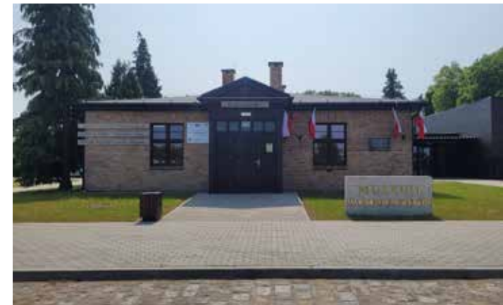
Woldenberg Museum building

MUZEUW WOLDENBERCZYKÓW W DOBIEGNIEWIE ul. Gorzowska 11, 66-520 Dobiegniew