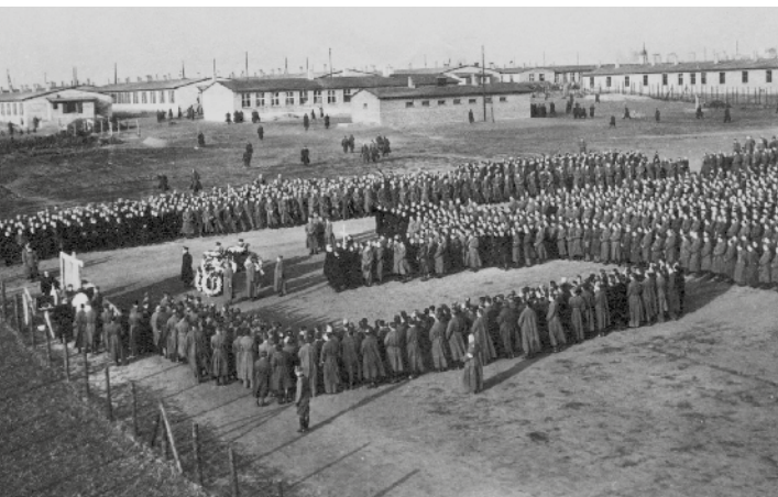
View of the camp, funeral

Oflag IIC Woldenberg was a German prisoner-of-war camp for Polish officers during the Second World War. Despite the captivity, it became a place of learning, culture and resistance, demonstrating the prisoners' strength of spirit, solidarity and patriotism.