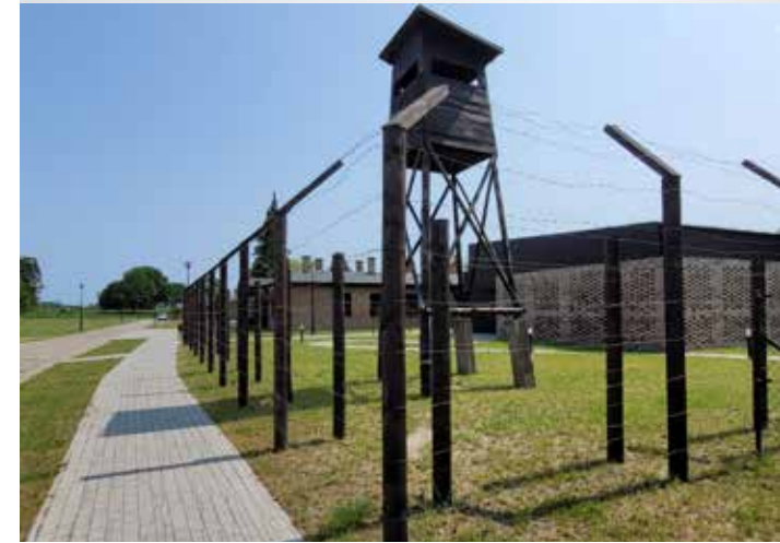
View of the grounds of the Woldenberg Museum

Today, the site of the former camp is home to a museum, a memorial dedicated to the fate of Polish officers, their steadfastness, their solidarity and their struggle to preserve their dignity and national identity under the conditions of captivity.